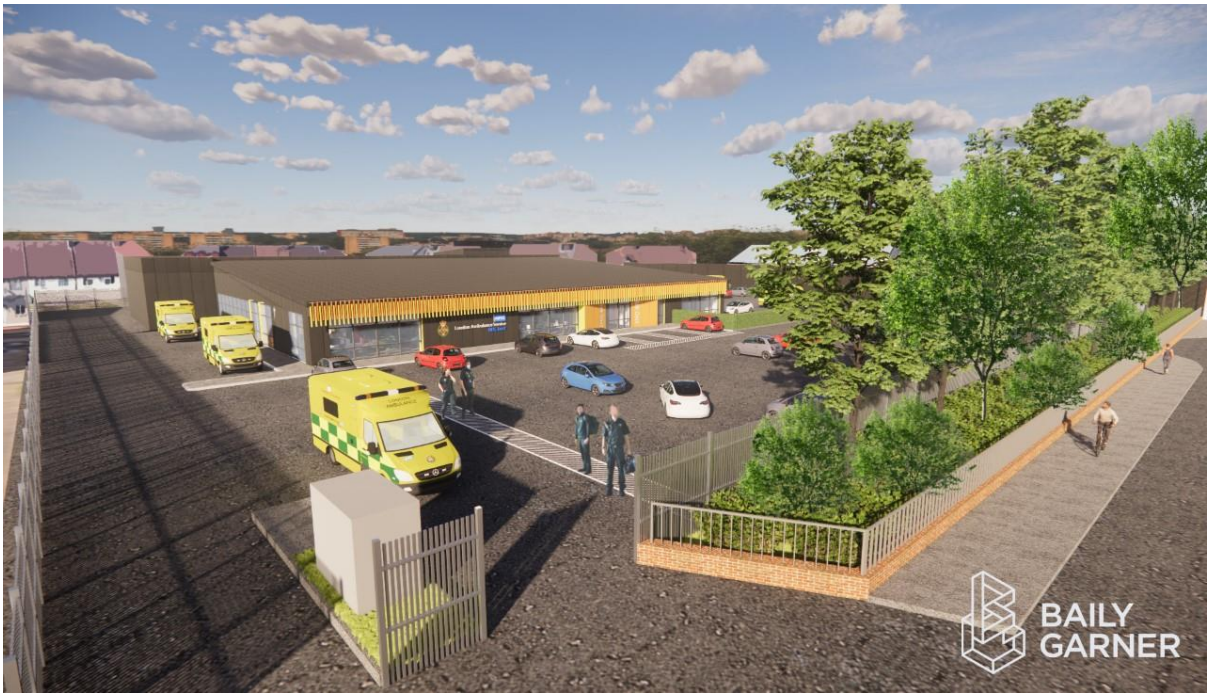
Figure 1 Artist impression of an LAS Ambulance Deployment Centre in Romford